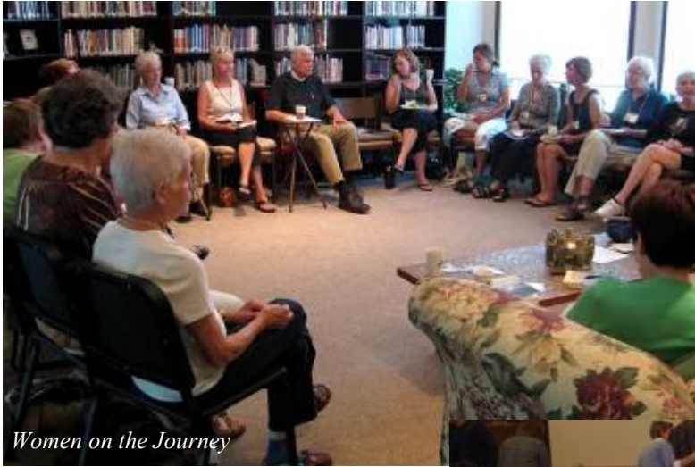
Women on the Journey

er Way ~ A Love Story ~ The Other Way ~ A Love Story ~ The Other Way ~