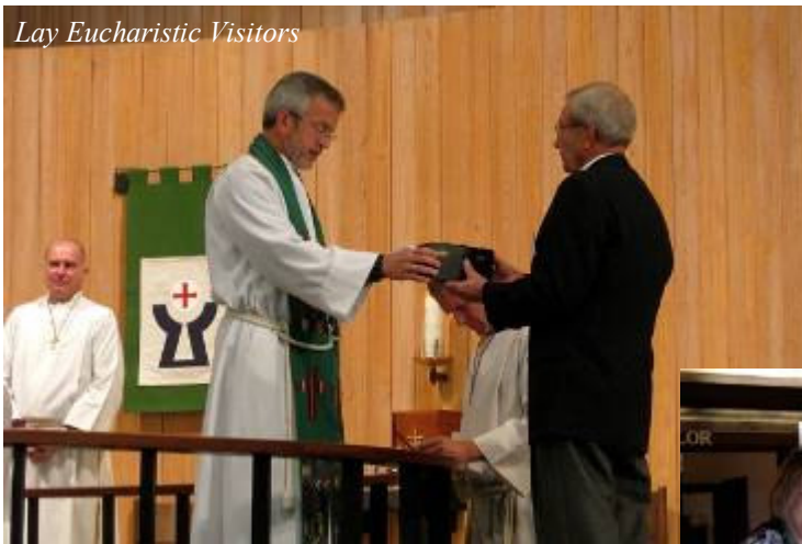
Lay Eucharistic Visitors

When we are hurting, we rely on the support of our brothers and sisters