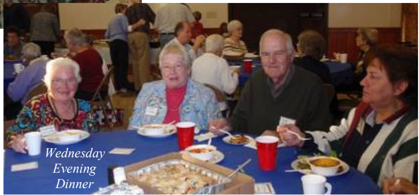
Wednesday Evening Dinner

... the breaking of bread and the prayers." Acts 2:42