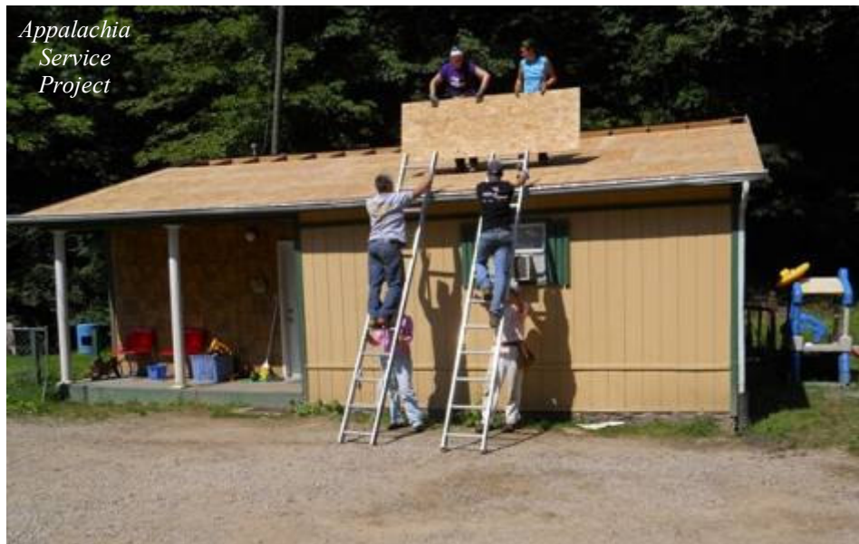
Appalachia Service Project

The Other Way ~ A Love Story ~ The Other Way ~ A Love Story ~ The Other